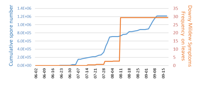
Figure 3: An example of field monitoring from a partner in Pessac-Léognan wine appellation along the 2021 growing season.

Spores were detected before symptoms apparition in 76% of the cases, with an average predictive length of 8 days for these anticipatory cases ( e.g. Figure 3). The fact that spore capture is not systematically detected before symptom development highlights the importance of data sharing and monitoring network. Furthermore, informative data have been collected to study spore production and transport at the regional scale, in correlation to symptom development and climatic conditions, giving an overall picture of the epidemic dynamic in the region.